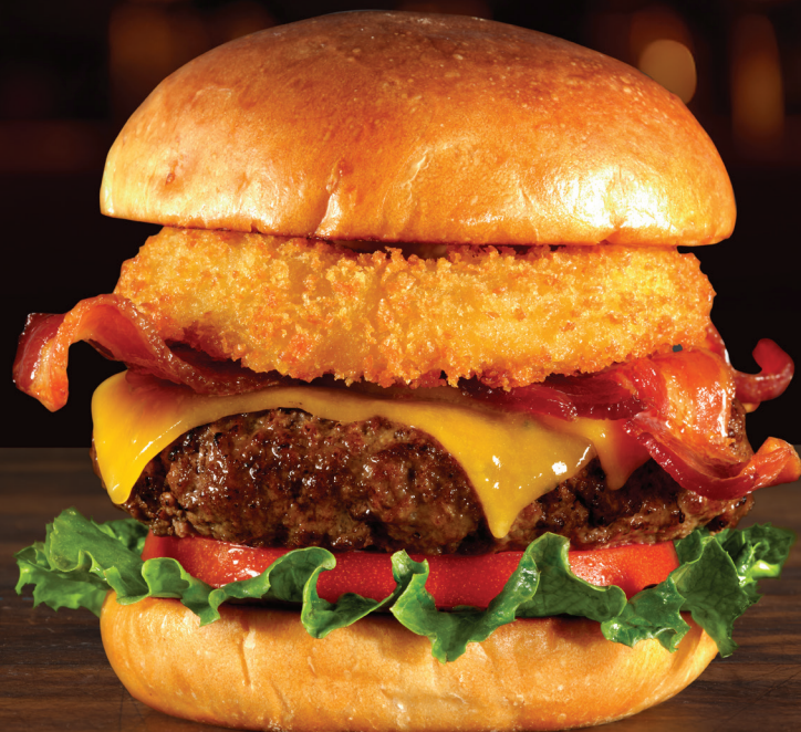
Original Legendary® Burger