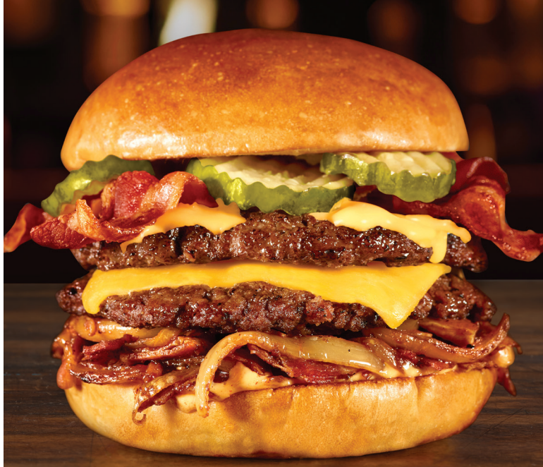
Legendary® Smashed Burger