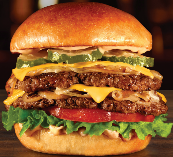
The Classic Smashed Burger