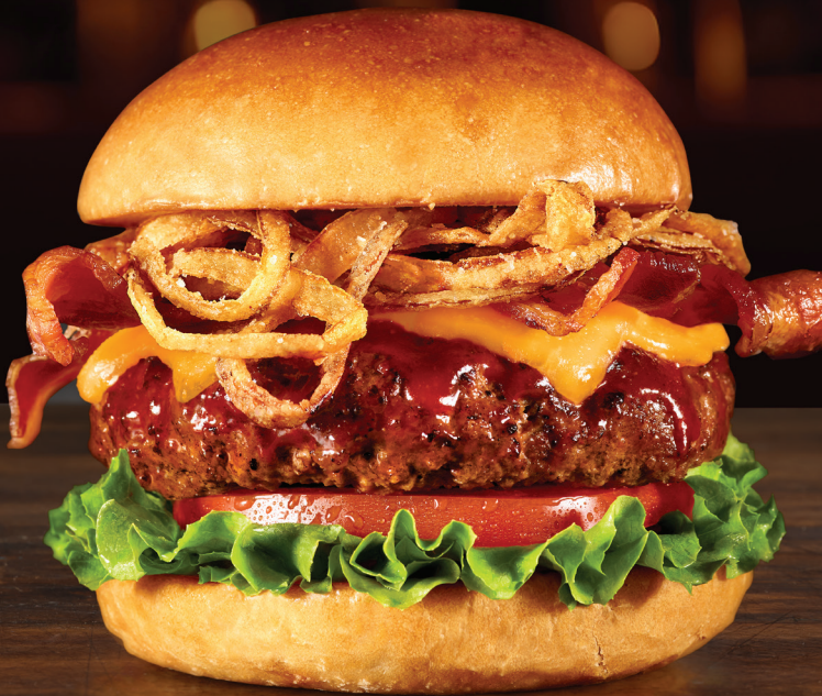
BBQ Bacon Burger