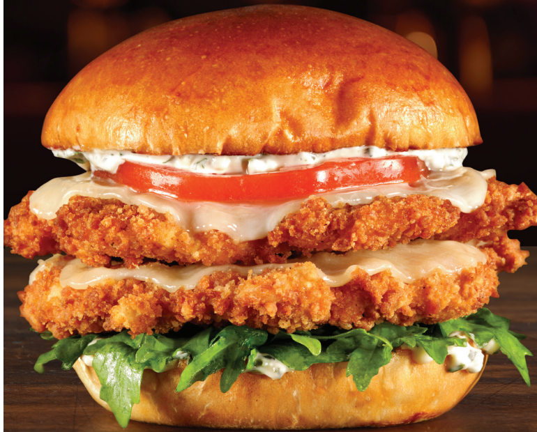
Messi Chicken Sandwich