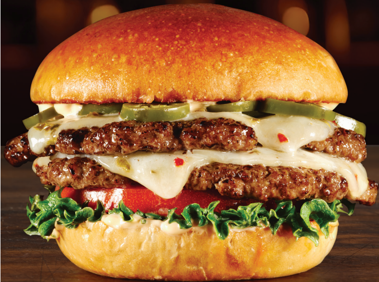
Spicy Diablo Smashed Burger