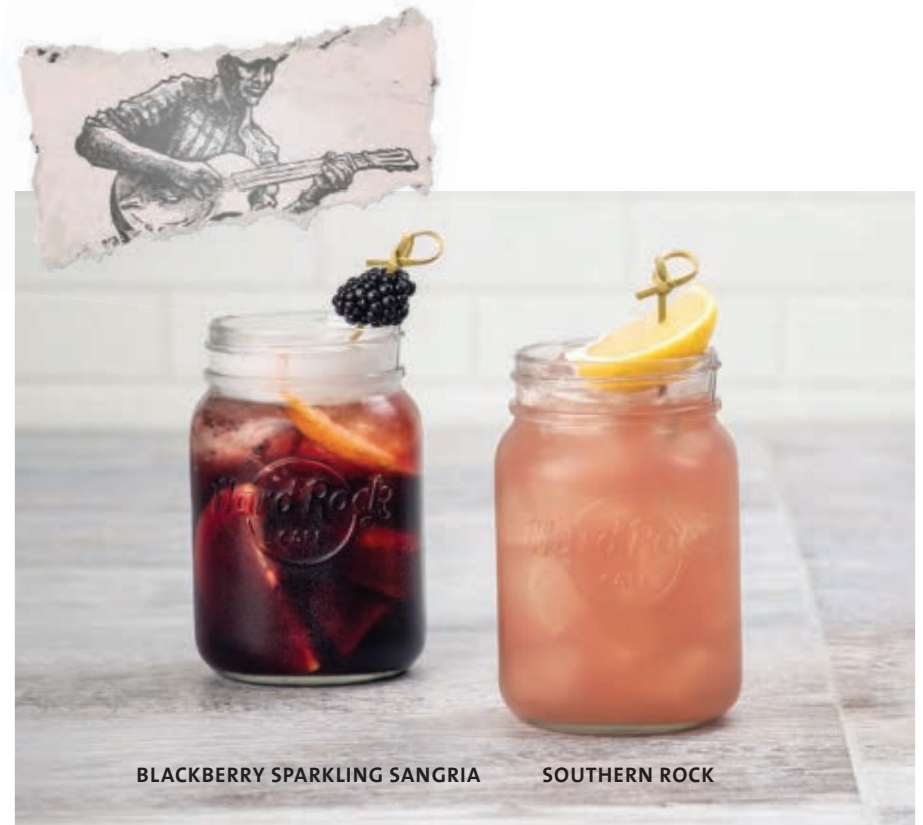
BLACKBERRY SPARKLING SANGRIA

Tito's Handmade Vodka, Bombay Sapphire Gin, Sailor Jerry Spiced Rum and Cointreau Orange Liqueur with sweet & sour and a splash of Coca-Cola®. $13.99 (233 cal)