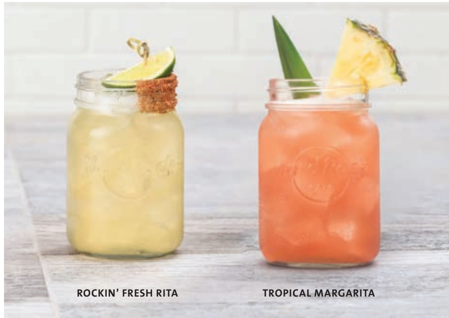
ROCKIN' FRESH RITA

Tahoe Blue Vodka, Bacardi Superior Rum, Beefeater Gin and DeKuyper Blue Curaçao with sweet & sour and topped with Red Bull® Yellow Edition. $13.99 (243 cal)