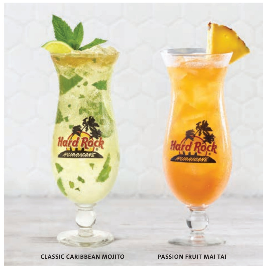
CLASSIC CARIBBEAN MOJITO

Our signature cocktail and a 1940s New Orleans classic! Bacardi Superior Rum, a blend of orange, mango, pineapple juice and grenadine, finished with a float of Bacardi Black Rum and Amaretto. † $13.99 (236 cal)