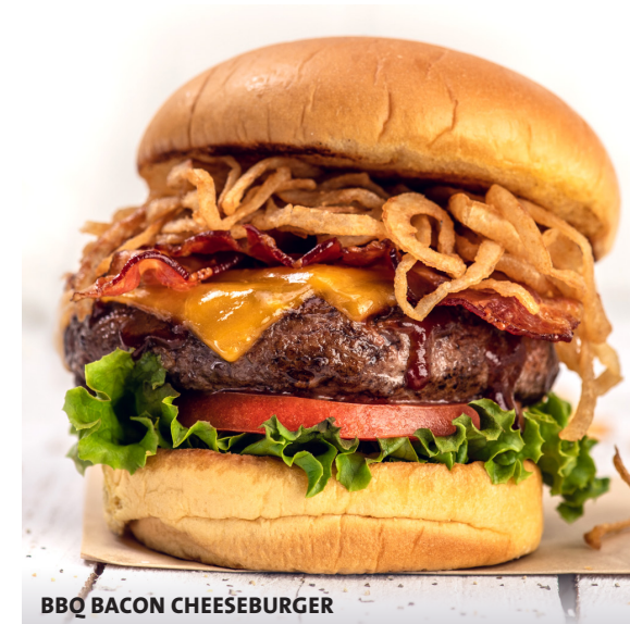
BBQ BACON CHEESEBURGER

Two smashed & stacked burgers seasoned and seared to medium-well, with pepper jack cheese, chipotle onions, leaf lettuce, vine-ripened tomato and spicy mayonnaise.* $18.99 (1282 cal)