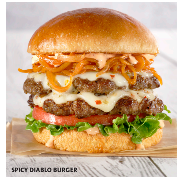
SPICY DIABLO BURGER