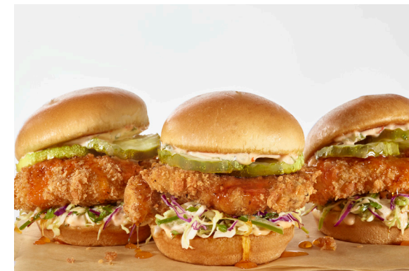
FRIED CHICKEN SLIDERS