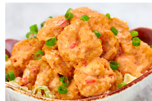
ONE NIGHT IN BANGKOK SPICY SHRIMP™