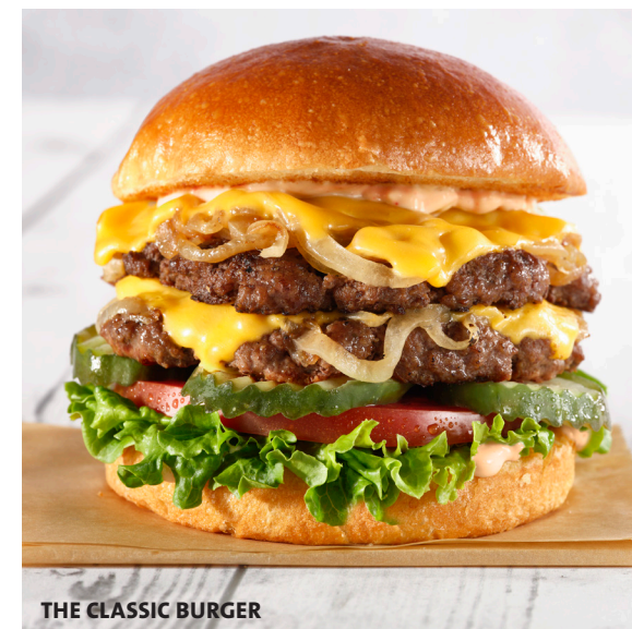
THE CLASSIC BURGER