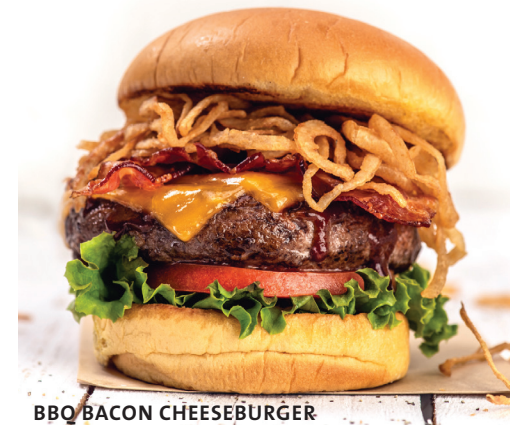
BBQ BACON CHEESEBURGER