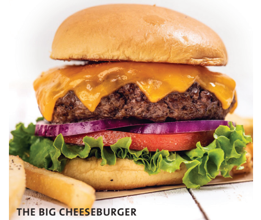
THE BIG CHEESEBURGER

We hold allergy information for all menu items, please speak to your server for further details. If you suffer from a food allergy, please ensure that your server is aware at the time of order. † Contains nuts or seeds. * These items contain (or may contain) raw or undercooked ingredients. Consuming raw or undercooked hamburgers, meats, poultry, seafood, shellfish or eggs may increase your risk of foodborne illness, especially if you have certain medical conditions. 2000 calories a day is used for general nutrition advice, but calorie needs vary. Additional nutritional information is available upon request.