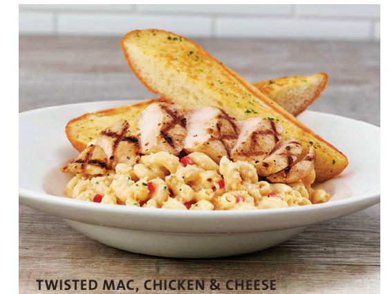
TWISTED MAC, CHICKEN & CHEESE

We hold allergy information for all menu items, please speak to your server for further details. If you suffer from a food allergy, please ensure that your server is aware at the time of order. † Contains nuts or seeds. * These items contain (or may contain) raw or undercooked ingredients. Consuming raw or undercooked hamburgers, meats, poultry, seafood, shellfish or eggs may increase your risk of foodborne illness, especially if you have certain medical conditions. 2000 calories a day is used for general nutrition advice, but calorie needs vary. Additional nutritional information is available upon request.