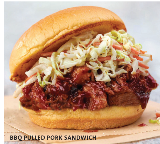
BBQ PULLED PORK SANDWICH

Crispy buttermilk-marinated chicken breast with leaf lettuce, vine-ripened tomato and ranch dressing, served on a toasted fresh brioche bun. Spice it up with our classic buffalo sauce upon request! $17.99 (1220-1260 cal)