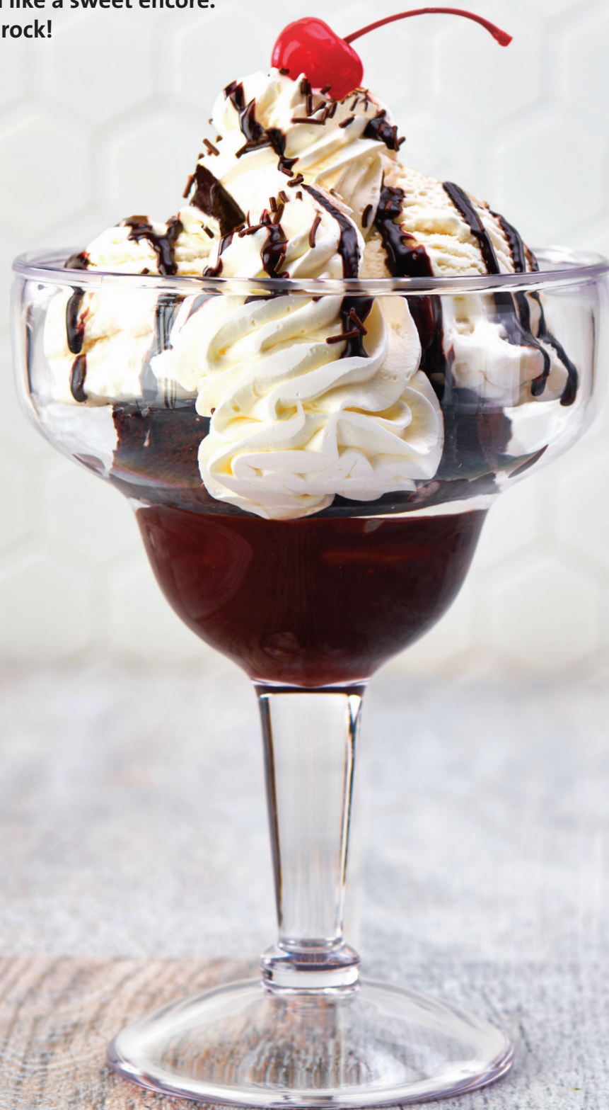
HOT FUDGE BROWNIE

From Milkshakes to Hot Fudge Brownies, nothing says rock n' roll like a sweet encore. Cheers to desserts that rock!