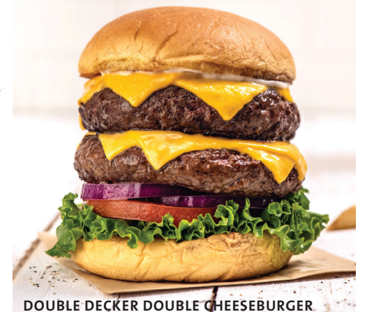
DOUBLE DECKER DOUBLE CHEESEBURGER