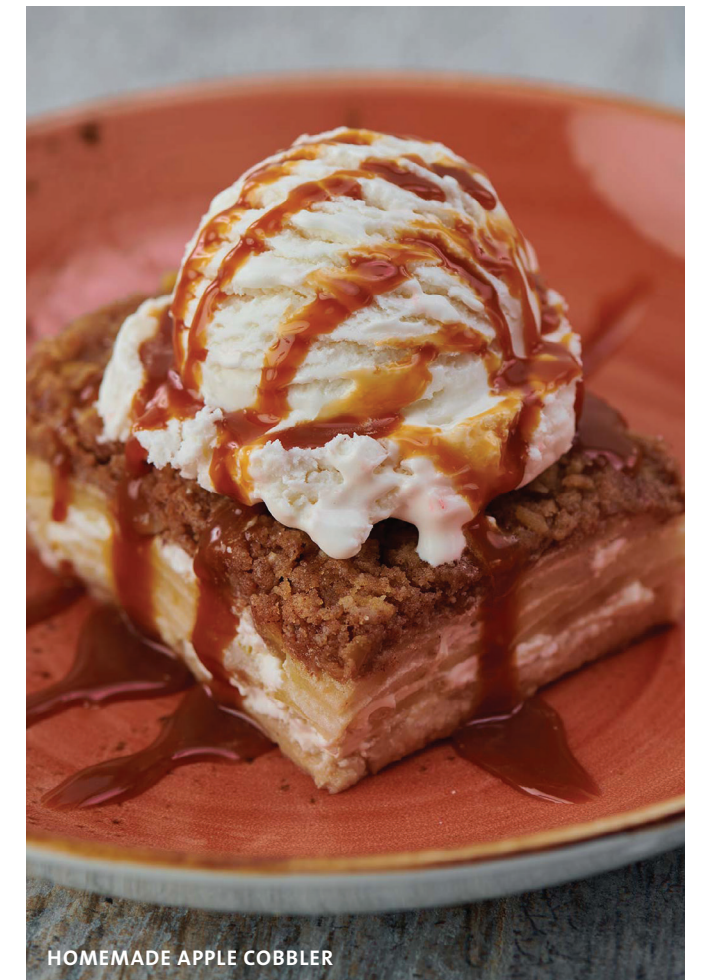
HOMEMADE APPLE COBBLER

Your choice of Madagascar vanilla bean or rich chocolate ice cream blended thick and finished with fresh whipped cream. $6.99 (557 cal)