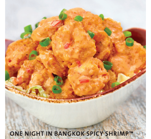
ONE NIGHT IN BANGKOK SPICY SHRIMP™